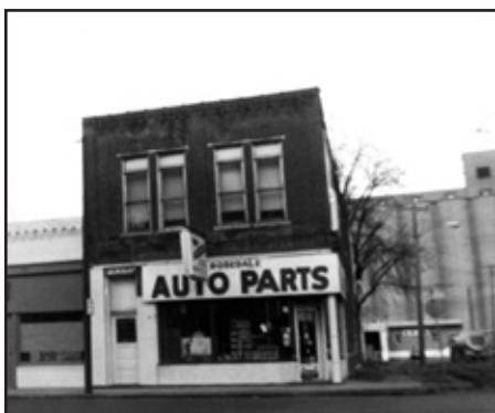
The Auto Parts building at 1000 Southwest Boulevard was the Rosedale Post Office from 1889 to 1910. The building in the photograph no longer is standing.