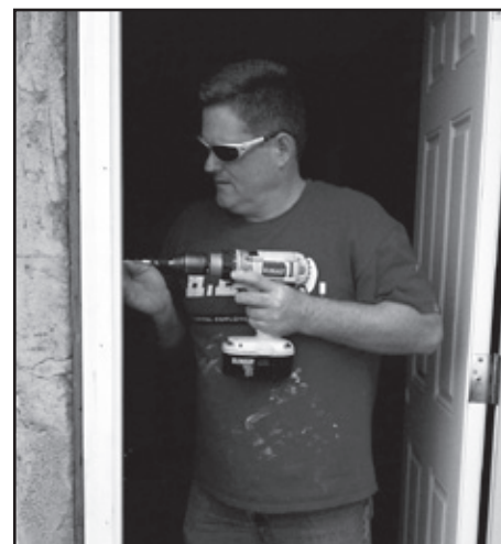
▶ Several new doors installed during Christmas in October will help Rosedale residents keep the cold out this winter.

O n October 1, RDA partnered with KU Med and Hospital to host the 16th year of Christmas in October in Rosedale. The program assists elderly or disabled low-income families with repair and upkeep projects each year.