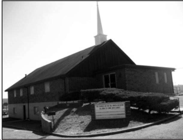
The current building for Greystone Heights M.B.C., erected in 1966. The church is visible from I-35, near the Cambridge Circle and 7th St. exits.

According to Pastor Ephthallia "Lou" Banks – in service at Greystone since 1993 – many of the church's members moved to other parts of the metro area as a result of the I-35 construction.