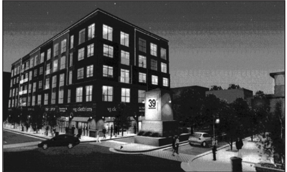
The new development plan along Rainbow will keep retail income in Rosedale while also providing good housing opportunities. The plan incorporates green design principals.

With the addition of a new hotel and commercial space for restaurants and retail, the area will help keep the dollars currently going to Missouri in Wyandotte County. The addition of high quality, safe housing is another plus