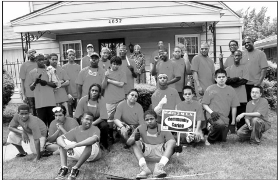
The Kauffman Scholars Males 2 M.E.N group did an excellent job cleaning up the Minnie St. area and providing a significant help to many elderly folks in the area.